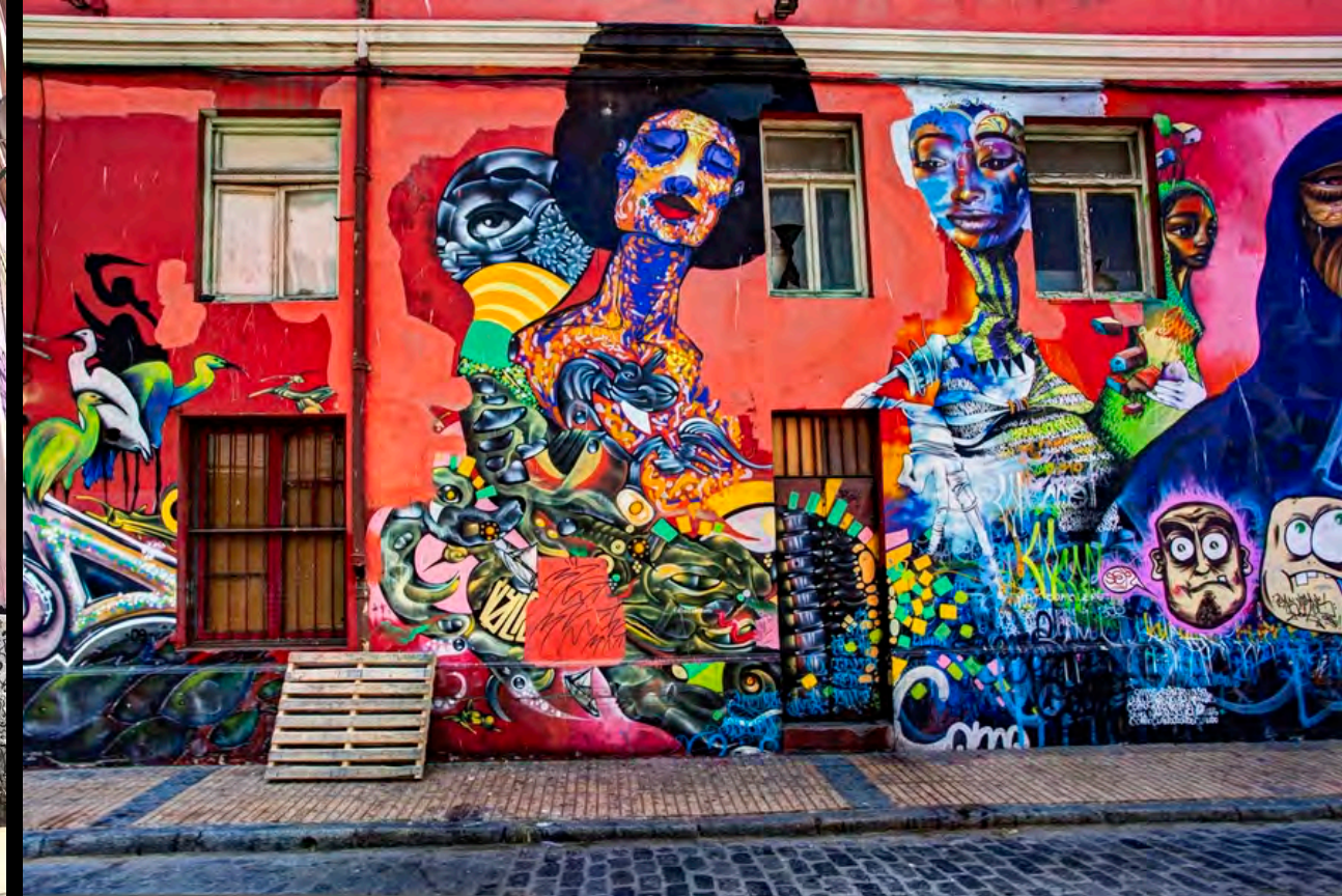
Non-official Art in Public Places