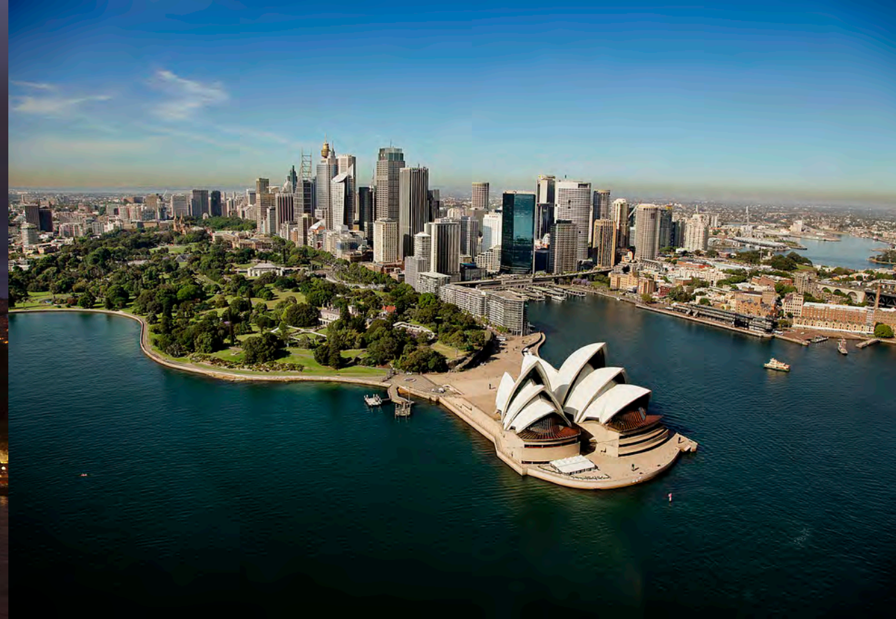
Iconic Places: Sydney Opera House