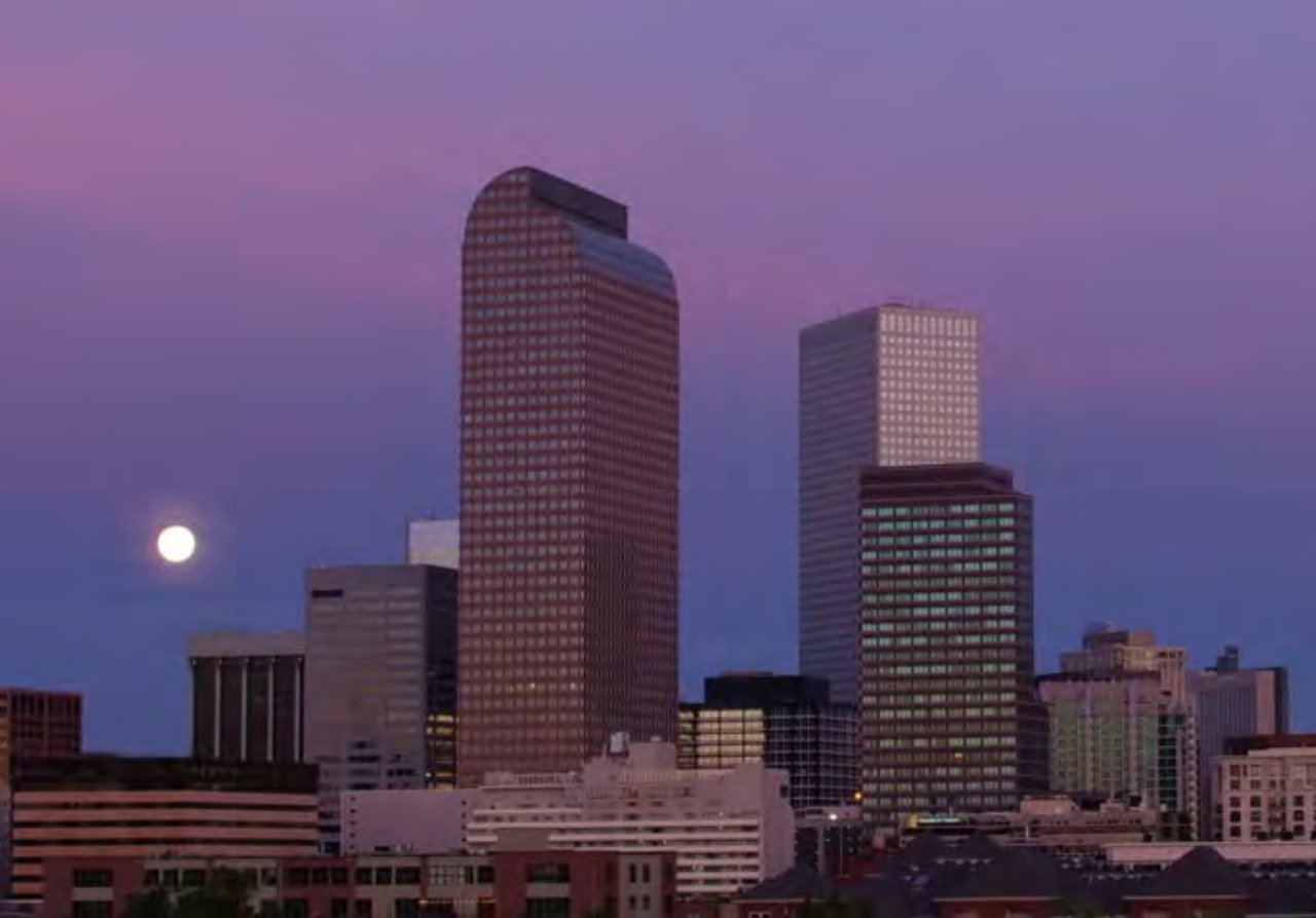
I.M. Pei, “Cash Register” Building, Denver