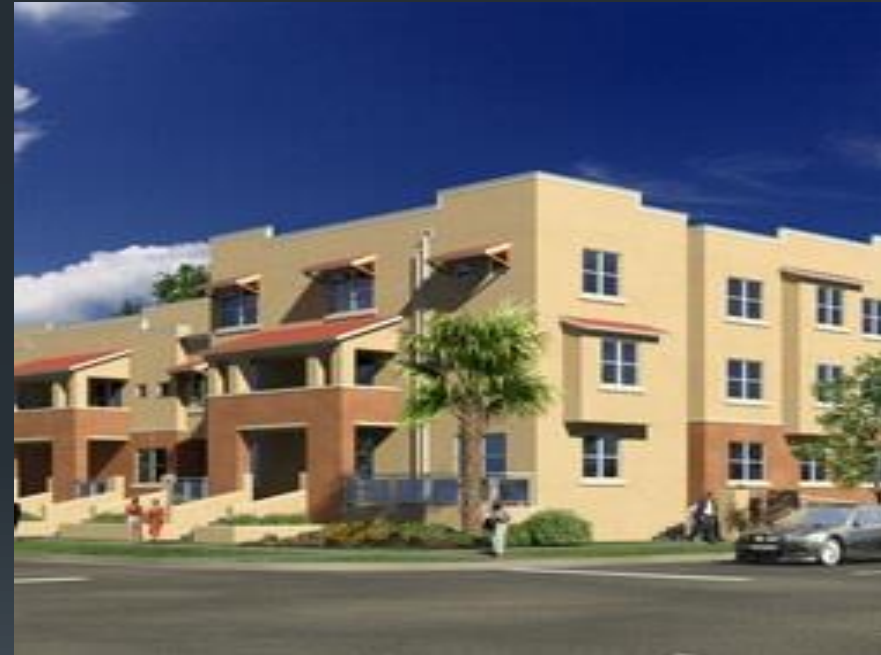
McKinley Lofts - Phoenix