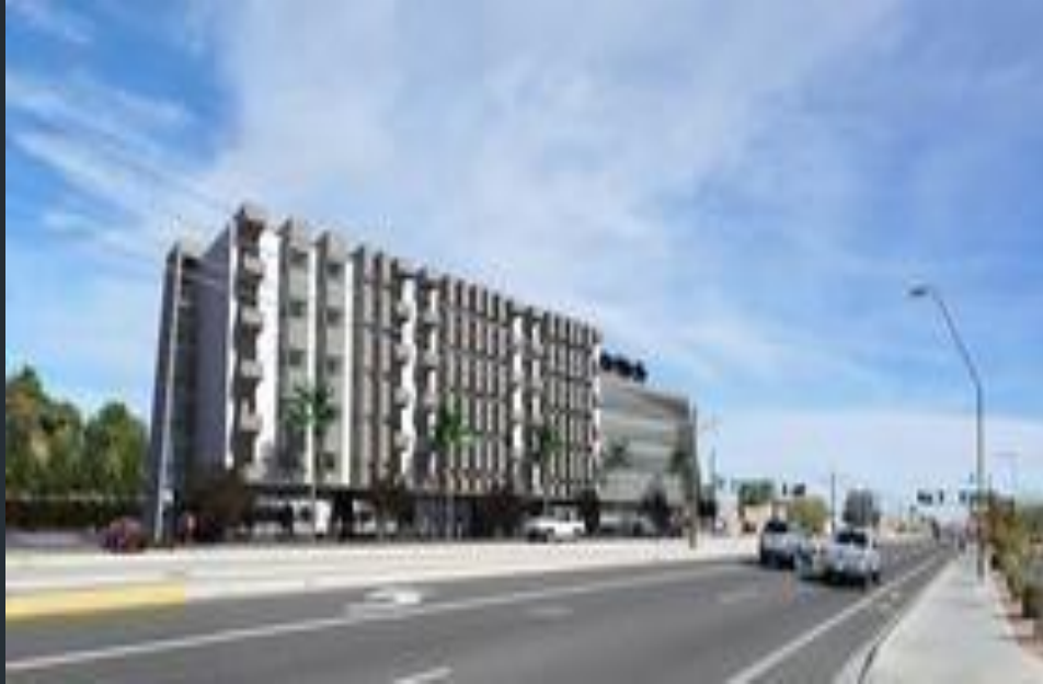
Gracie's Village - Tempe