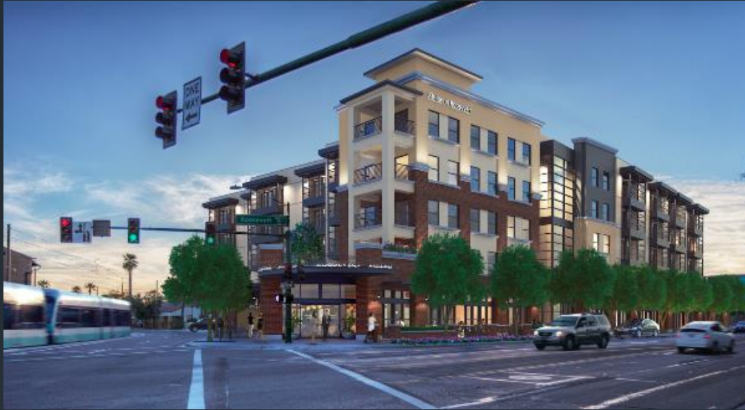
Union at Roosevelt – Phoenix Residences on Farmer - Tempe