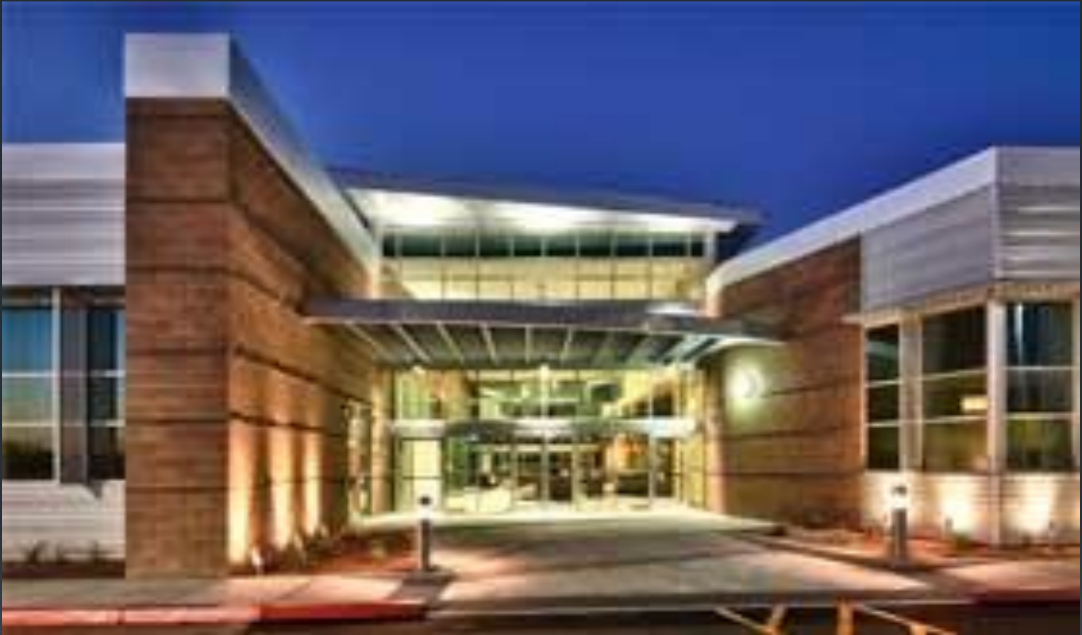
Adelante Healthcare Center - Mesa

43,000 square foot, Primary health care center