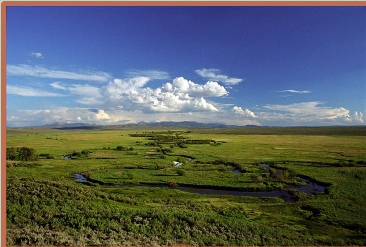
North Park (CO) Master Leasing Plan Area