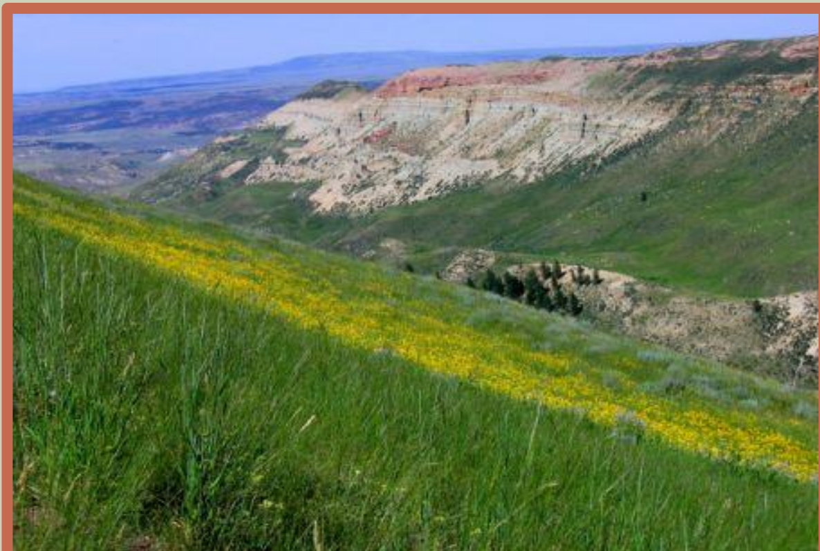
Greater Little Mountain (WY) Master Leasing Plan Area