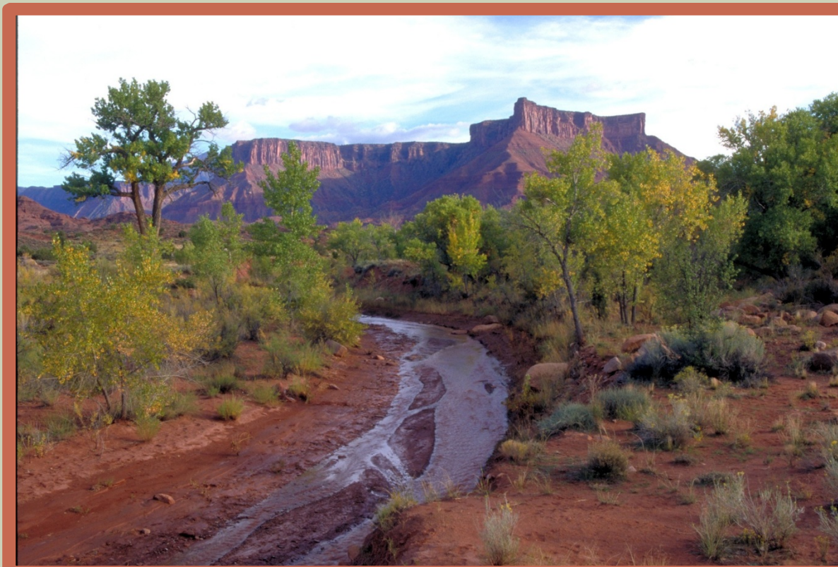
Moab (UT) Master Leasing Plan Area