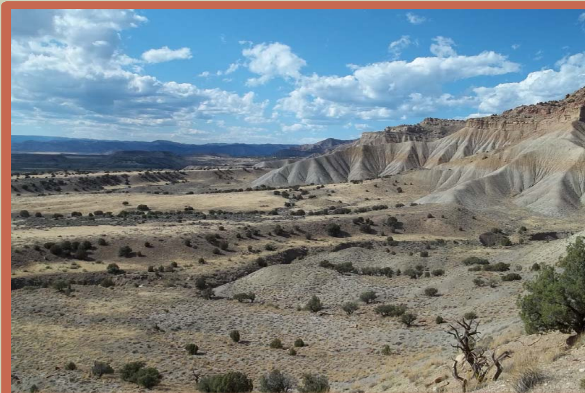
Shale Ridges and Canyons (CO) Master Leasing Plan Area