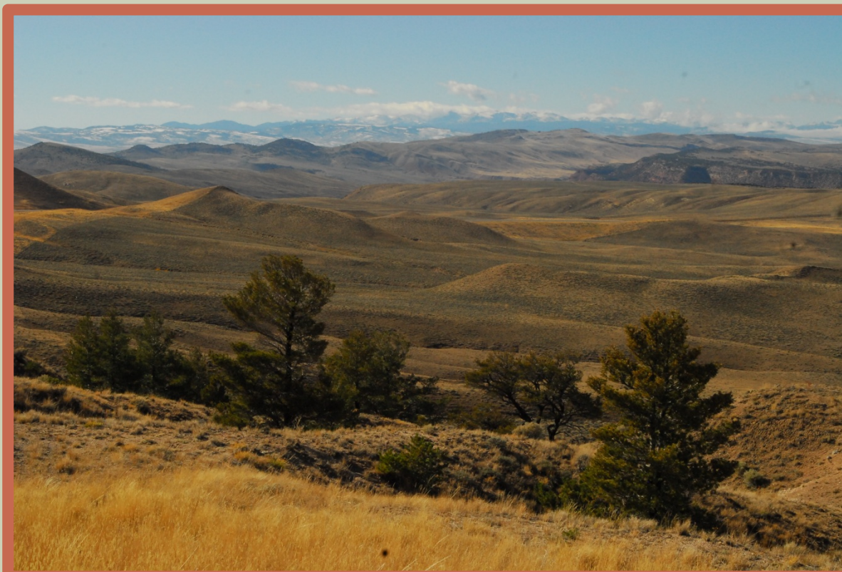
Beaver Rim (WY) Master Leasing Plan Area