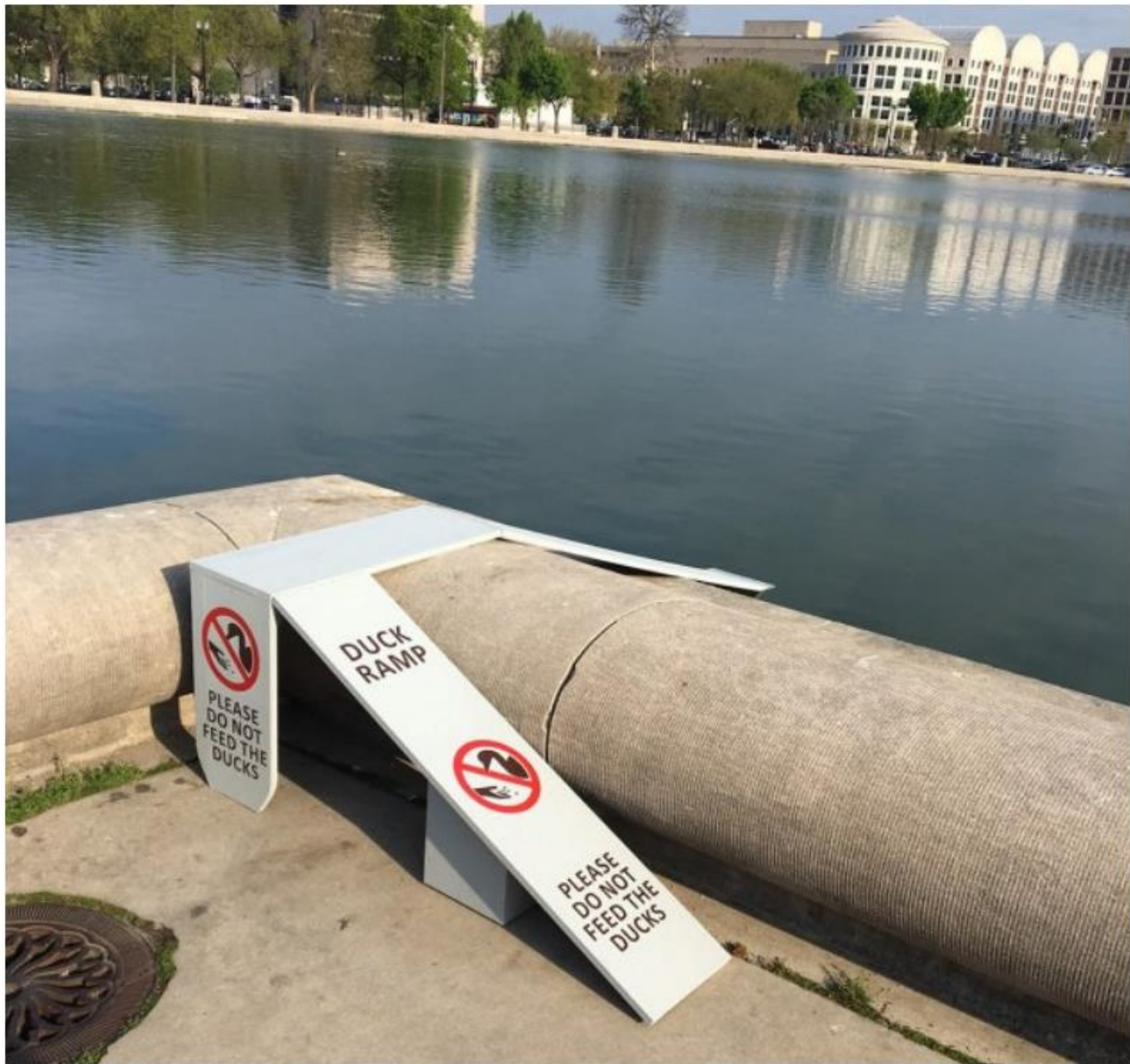
Architect of the Capitol / One of the ramps at the Capitol Reflecting Pool.