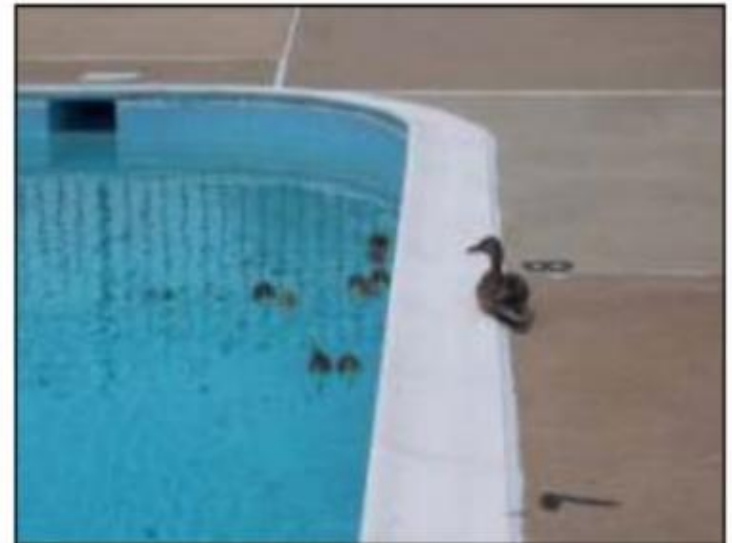
A mother duck and her ducklings at the Glen pool in 2015.

In a situation like this, please contact Arlington County Animal Control and our property manager for help.