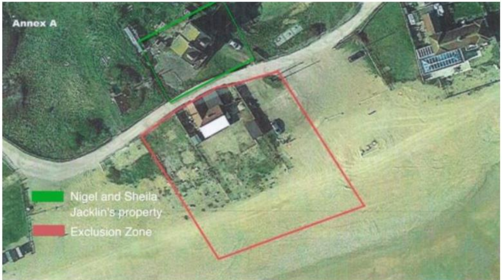
The exclusion zone placed on Sheila and Nigel