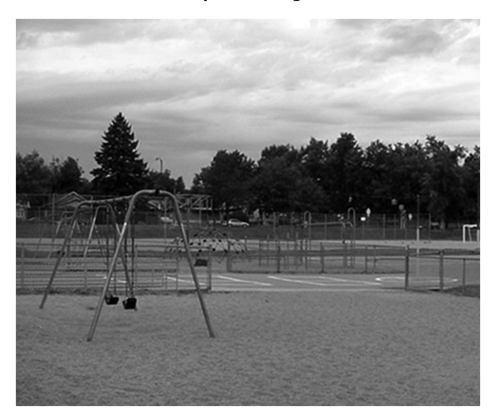
Photo 2: A view of the pre-existing condition at Columbian elementary