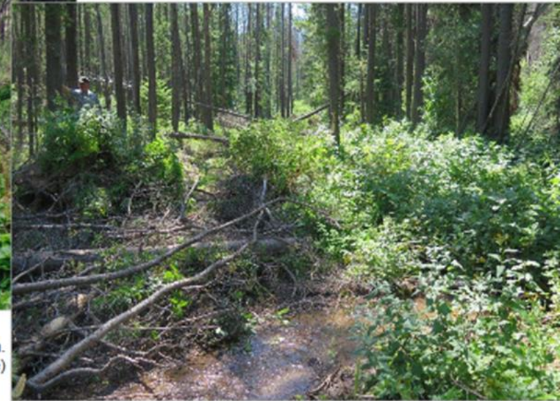
Before (above) and after images of stream restoration.