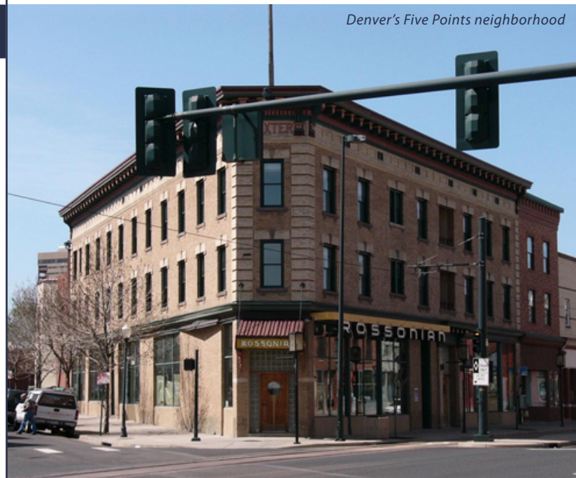
Denver's Five Points neighborhood

The CEDC is a year-long transactional clinic. The students are currently working as co-counsel and, in addition to that representation, will soon begin to represent clients without co-counsel. In order to allow the students to