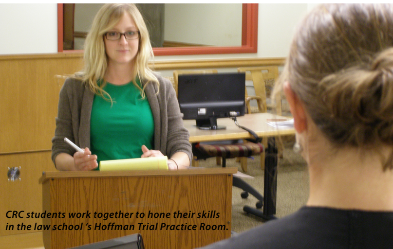
CRC students work together to hone their skills in the law school’s Hoffman Trial Practice Room.

Other student teams have worked on such diverse matters as filing a federal anti-discrimination complaint on behalf of a woman who was fired after fourteen years with her employer, and securing a protection order for an eight-month pregnant woman who was attacked by her boyfriend. And students continue to file lawsuits and work with members of the community to fight rampant wage theft, where employers refuse to pay wages due to the working poor.