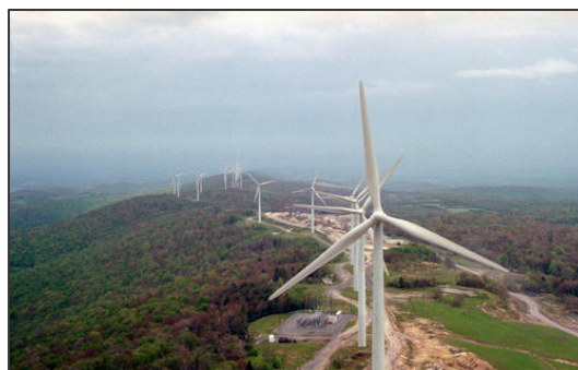
According to NREL, the 44 turbines at the Mountaineer Wind Energy Center in West Virginia pictured above produce a maximum of 66 MW of electricity. Each turbine stands 228 feet above Backbone Mountain with rotor blades of 115 feet in diameter.

Using the NREL Small Wind Turbine Productivity Estimates, it is possible to roughly estimate electricity generation potential for various turbine sizes and wind classes. Table 3 (next page) uses the median NREL productivity estimate for each wind class multiplied by swept area of selected rotor diameters to estimate yearly energy produced by a range of small wind turbines. Next, using data from Table 3, it is possible to estimate the number of homes that could be powered by a range of small wind turbine sizes operating in classes 2-7 of wind power. In Table 4 (next page) the median energy output figures in kWh/year are divided by U.S. national average annual home energy usage (10,565 kWh) to estimate the number of average homes powered per year. These estimates are useful for understanding the scale of small wind potential and how it relates to wind class and turbine rotor size. For example, a wind turbine 5 m in diameter (about 16 feet across, or eight-foot blades) can power one home for a year in class 3 winds, while a turbine of twice the diameter can power more than four homes in the same wind.