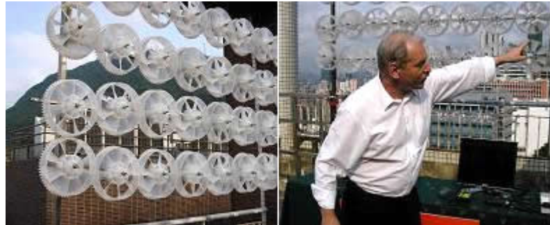
Micro-wind turbines.

The range of new turbine types enable wind power to be harnessed in a much wider variety of settings than ever before. This may mean that many communities that have never processed an application for a turbine permit may need to review one in coming years.