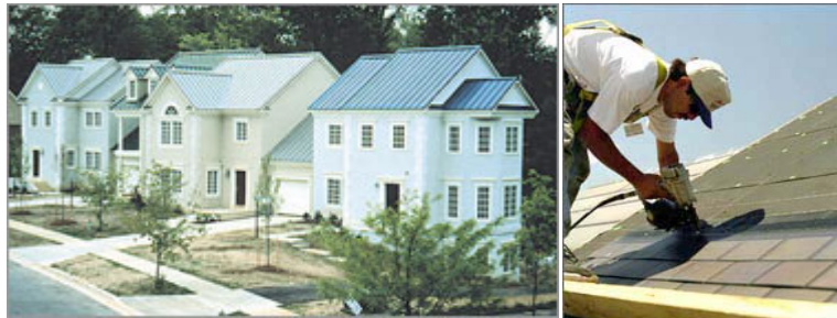
Left: The house in the foreground has thin film PV panels installed on the roof. Right: Installing thin film roof shingles.

In addition to increasing efficiency in traditional rigid PV panels manufactured using silicone and very high temperatures, NREL and others have developed a “thin film” PV technology that is flexible and is made from less costly materials. These lightweight, flexible PV materials use less energy in production, have lower production costs per foot, and can be used in a wide variety of applications. Thin films are less efficient than today’s rigid panels – typically about six percent. Some applications for thin film PV include building applications such as roof panels or shingles.