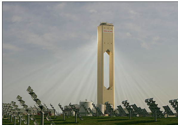
The 11 MW concentrated solar thermal plant in Seville, Spain.

A newcomer on the utility-scale solar power scene is concentrated solar thermal, which uses parabolic mirrors to focus solar rays into concentrated beams. Multiple beams are focused together, and the resulting heat is used to turn water to steam. As with parabolic trough solar thermal, the steam turns turbines to generate power. The first module of a solar thermal concentration plant came online in May of 2006, in Seville, Spain (see image, right). It has an 11 MW capacity, providing enough electricity to power an estimated 6,000 local houses. Additional modules of the plant are being built, with construction expected through 2013. The ultimate designed power capacity of the plant is 300 MW. The project is heavily subsidized, as an initiative to help meet European Union carbon emissions reductions goals. 28 Similar plants are planned for Algeria and Morocco. Utilities in California, Nevada, and New Mexico are reportedly in negotiations for concentrated solar thermal installations.