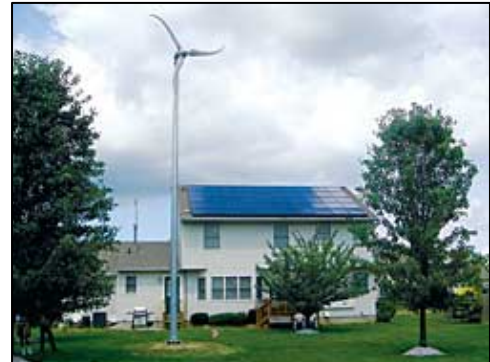
Solar and wind energy production as residential accessory uses.

Alternative energy production through the harnessing of renewable natural resources is an important component of environmental and economic sustainability. 1 In many places in the U.S., the cost of wind power development is now comparable to more traditional energy development, such as coal-fired plants. Wind resources in the U.S. could provide as much as 20 percent of our total electrical power demand. Currently, solar power is cost-effective on the utility scale only in the desert southwest, but small-scale solar has proven cost-effective over time for tens of thousands of small-scale users. According to the U.S.