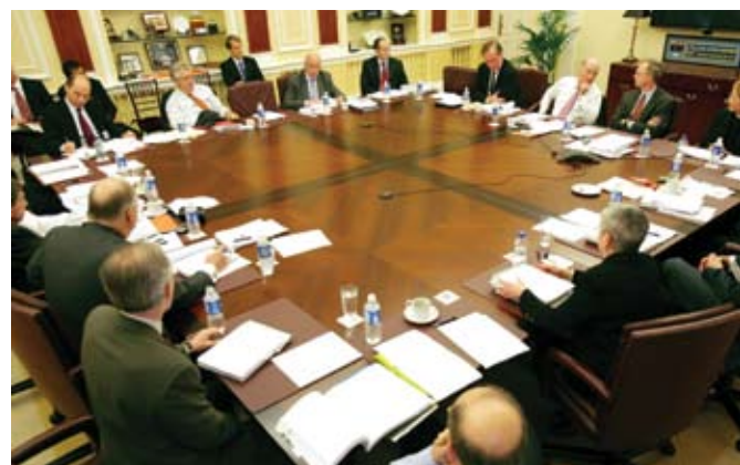
Commissioners convene at the U.S. Chamber of Commerce to discuss the challenges facing America's capital markets.

There will be some overlap with the findings and recommendations of other groups, but this Commission attempted to reduce as much as practical the duplication of the examination of issue areas. For example, although the Commission would support efforts to reform America's litigation system to reduce frivolous lawsuits, substantial work has already been done by others in this area, including the U.S. Chamber Institute for Legal Reform, which has begun its own initiative to comprehensively examine the securities class action litigation system. The Commission does make one important recommendation in this area. Given that the Private Securities Litigation Reform Act (PSLRA) has been in effect for more than 11 years, the Commission recommends that Congress call upon the SEC to undertake a comprehensive study of the state and federal civil, regulatory, and criminal enforcement mechanisms to assess whether they are enhancing the goals of investor protection and capital formation, including whether the PSLRA is meeting the objectives set forth by Congress.