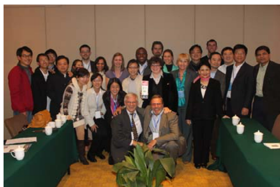
Graduate students and professors, Wuhan Colloquium, November 2009

sources and access to primary sources of literature including statutes, and analytical interviews. Participants also discussed the challenges of utilizing secondary literature, and balancing reasonable use of footnote citations without undermining integrity of originality of research work. In addition, a listserv based discussion board has now been set up to facilitate further networking and co-operation amongst themselves and within the IUCN Academy of Environmental Law structure.