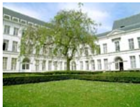
Faculty of Law, Ghent University, Belgium